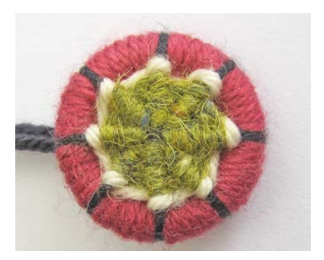
Step 9: Using another shade of yarn work one more round of stitches as on Step 7.