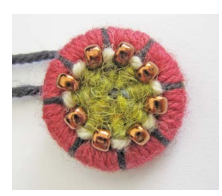
Step 10: Using a finer sewing needle and thread, sew beads into place between 'spoke' framework.