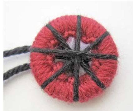
Step 5: Use one yarn end to create a framework for the next step – think of this like spokes of a wheel and make sure the framework is evenly spaced. Tie yarn ends together at the reverse of the button.