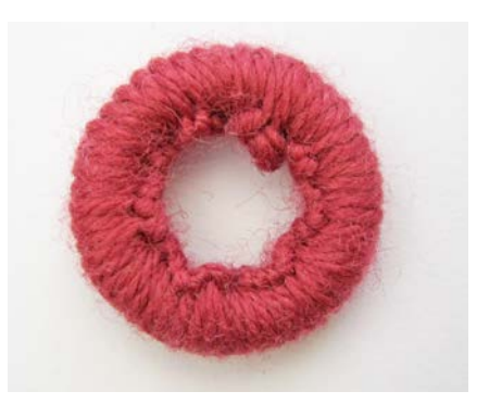
Step 3: Turn the ridge made by the blanket stitches into the centre of the ring.