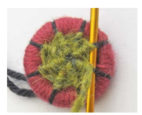
Step 8: Continue to sew centre of the button is full up. Take yarn through to the reverse of the button and fasten off.

It helps to think 'two steps forward, one step back'.