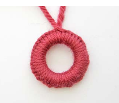
Step 2: When the ring is completely full join both yarn tails by either knotting or sewing them together.

Step 1: Using a blunt knitters sewing needle and a length of your chosen yarn shade, sew a round of blanket stitch around the plastic ring, making sure to make enough stitches to fill it up tightly.