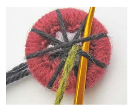
Step 7: Place your needle through from the front between around the spokes until the the two previous 'spokes' so that the yarn wraps itself around one 'spoke'. Bring your needle out between the next two spokes.

It helps to think 'two steps forward, one step back'.