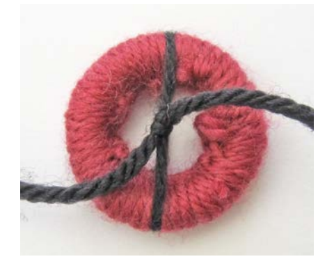
Step 4: Using your next chosen yarn shade knot the yarn ends at the centre back of the button.