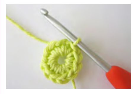
1ch, (does not count as a st), 12dc into the loop, pull tail end to tighten magic loop, ss to join.