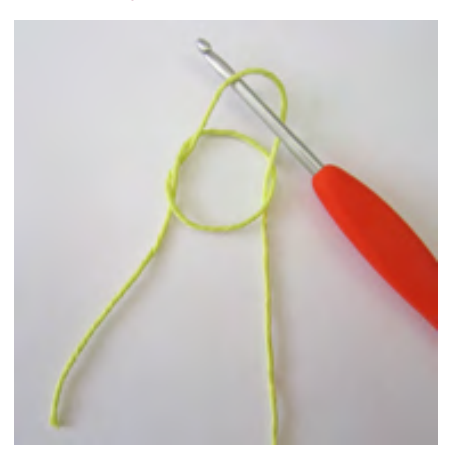
Using 3mm hook throughout and yarn A make a magic loop.

Thread 42 beads onto yarn C . A video tutorial for threading beads onto yarn can be found on the Janie Crow channel on youtube.com.