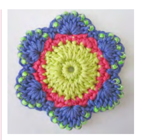
ROUND 3 (WS FACING): join yarn C into any st by working 1ch, 1dc into same st, ★ skip 2sts, 7btr into next st, skip 2sts, 1dc into next st; repeat from ★ to end, omitting last dc on final pattern repeat, ss to 1st dc to join. (6 petals made) Fasten off.

A video tutorial for beaded treble stitches can be found on the Janie Crow channel on youtube.com.