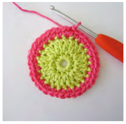
ROUND 2: join yarn B into any st by working 1ch, 2dc into same st, 1dc into next st * 2dc into next st, 1dc into next st; repeat from * to end, ss to 1st dc to join. Turn. (36sts) Fasten off.