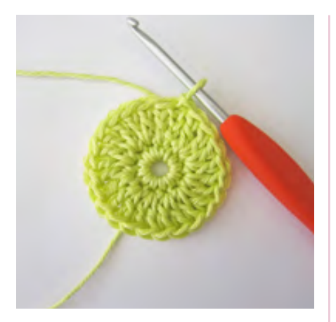
ROUND 1: 3ch (counts as 1tr), 1tr into st at base of 3ch, 2tr into each st to end of round, ss to 3rd ch to join. (24sts) Fasten off.