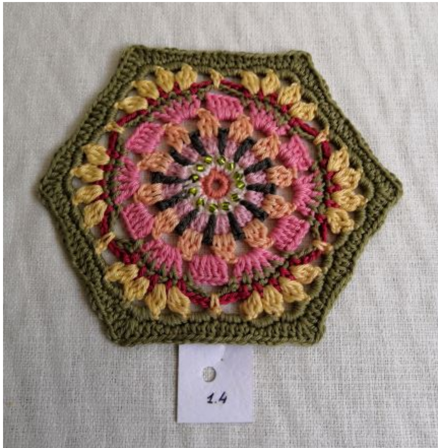
Picture 21. Motif 1.4 SIDE A