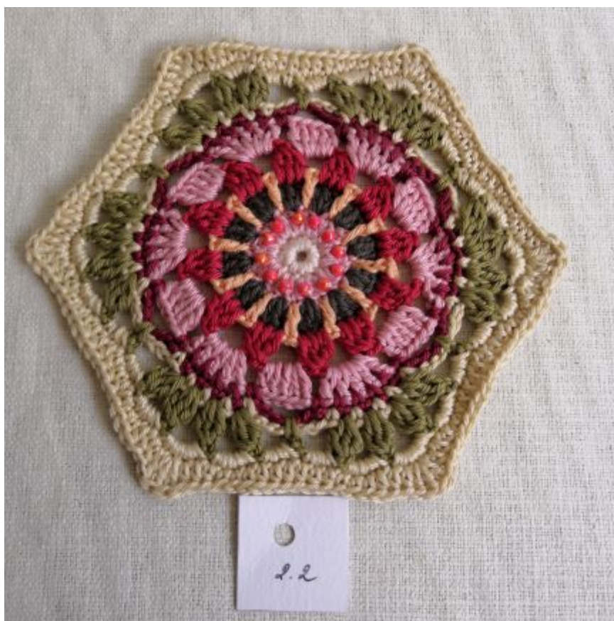
Picture 26. Motif 2.2 SIDE B