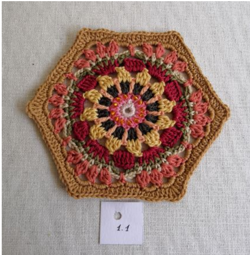
Picture 17. Motif 1.1 SIDE A