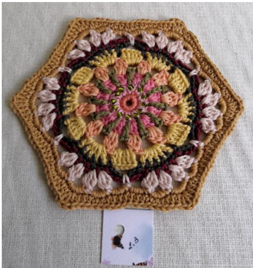
Picture 27. Motif 2.3 SIDE B