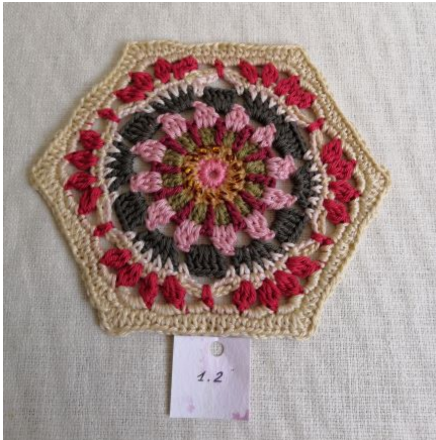
Picture 19. Motif 1.2 SIDE A