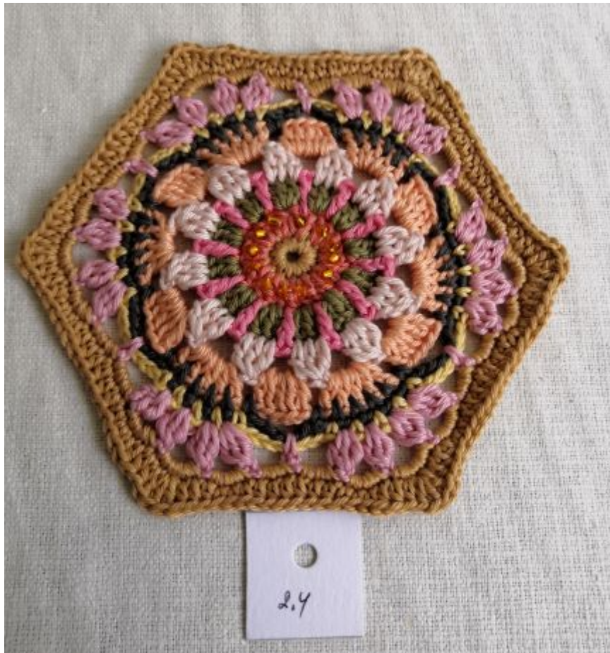
Picture 28. Motif 2.4 SIDE B