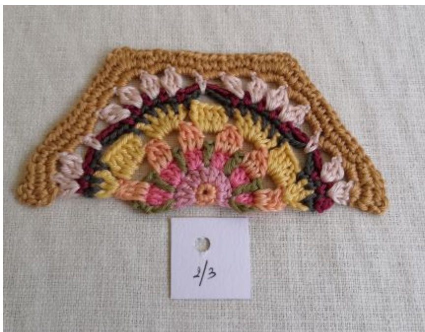
Picture 28. Half of motif 2.3 SIDE B