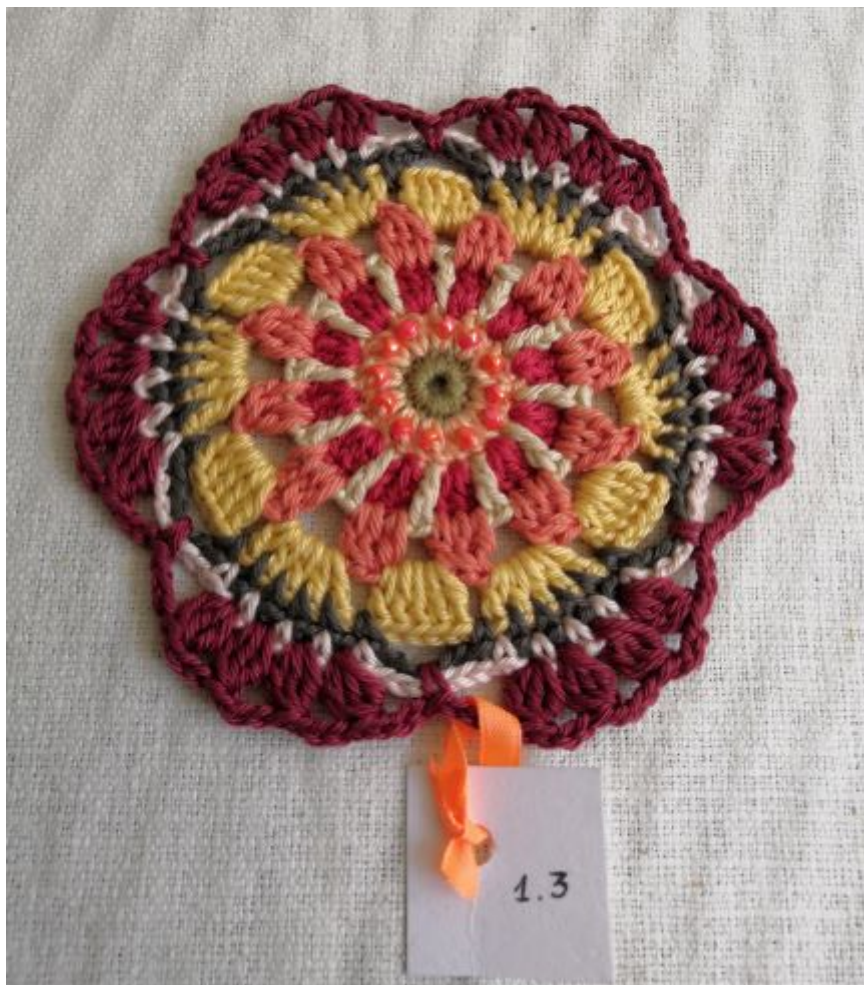
Picture 20. Motif 1.3 SIDE A