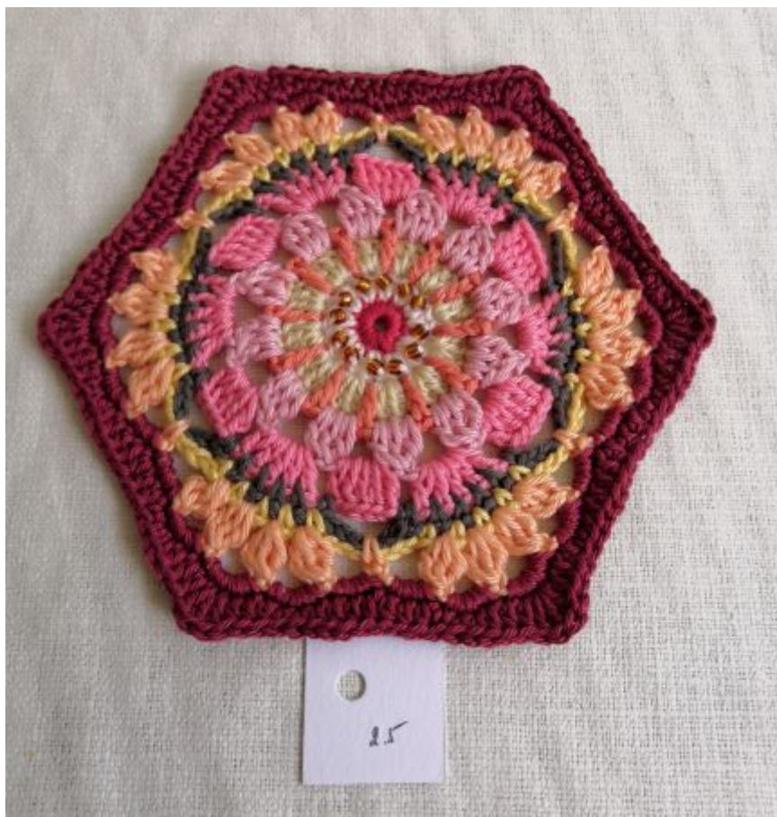
Picture 29. Motif 2.5 SIDE B