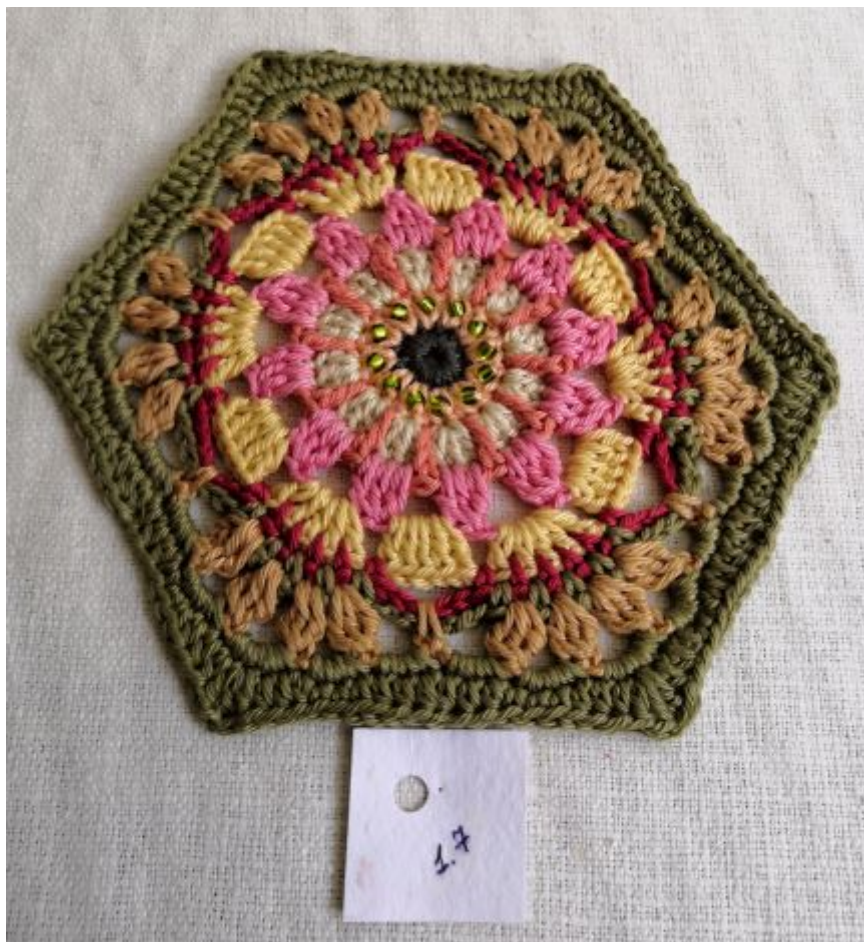
Picture 24. Motif 1.7 SIDE A