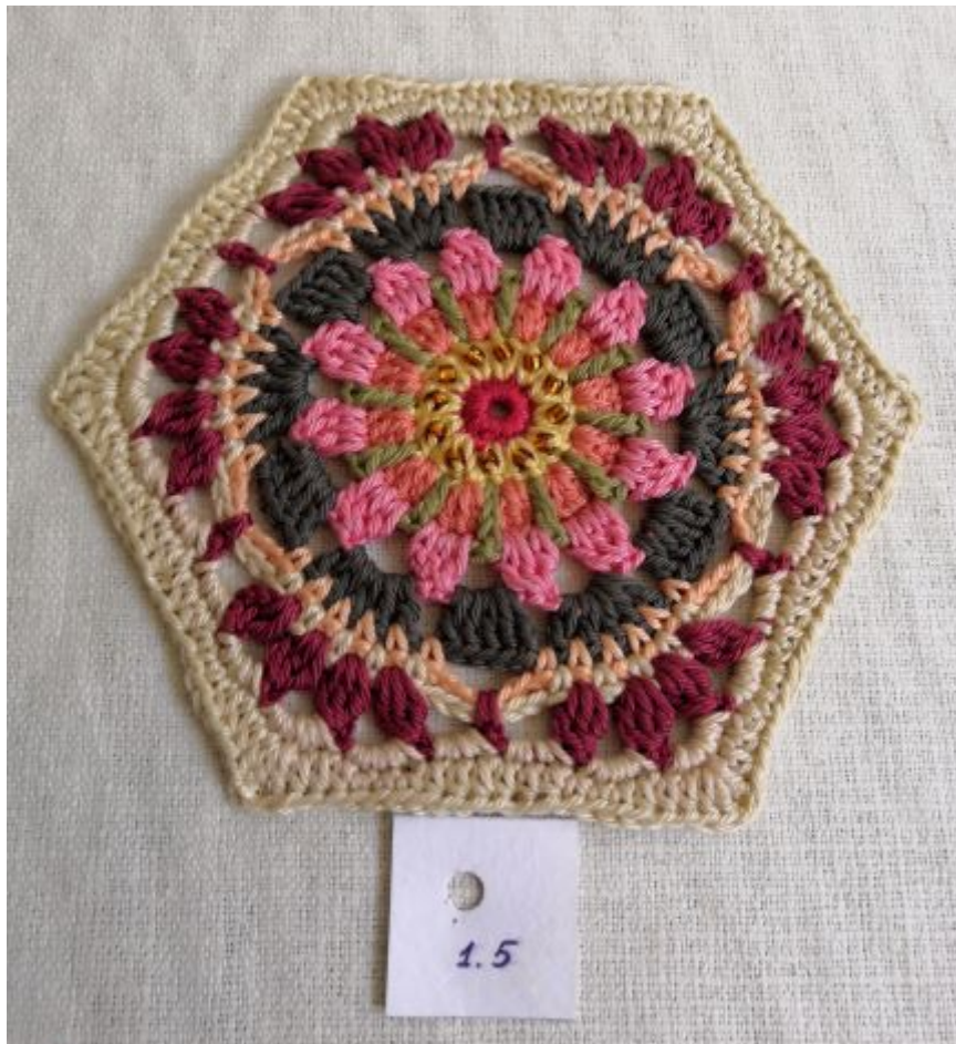
Picture 22. Motif 1.5 SIDE A