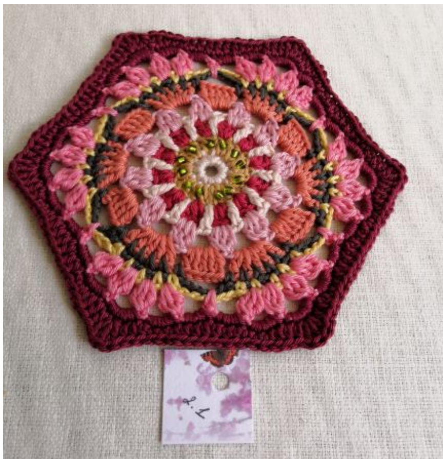
Picture 25. Motif 2.1 SIDE B