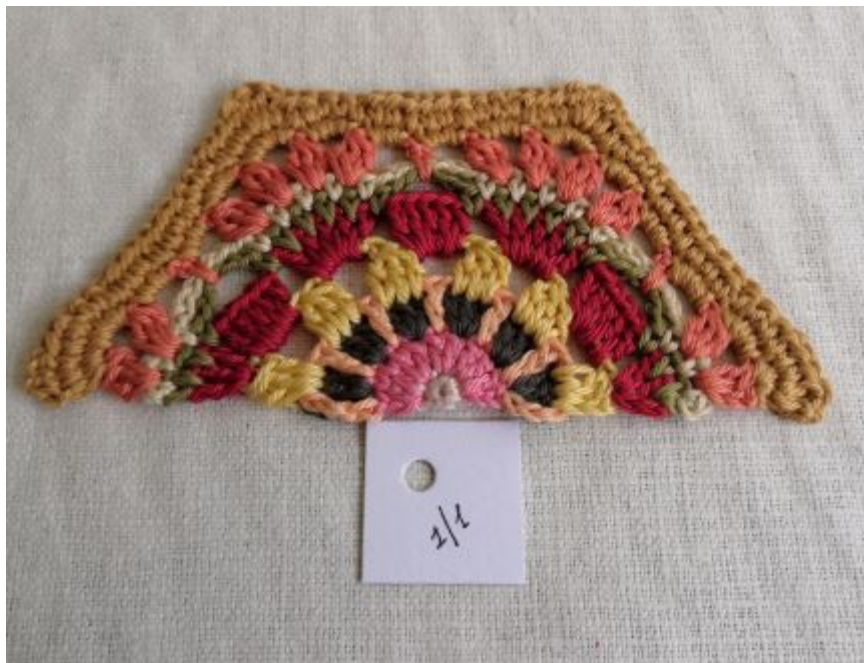
Picture 18. Half of motif 1.1 SIDE A