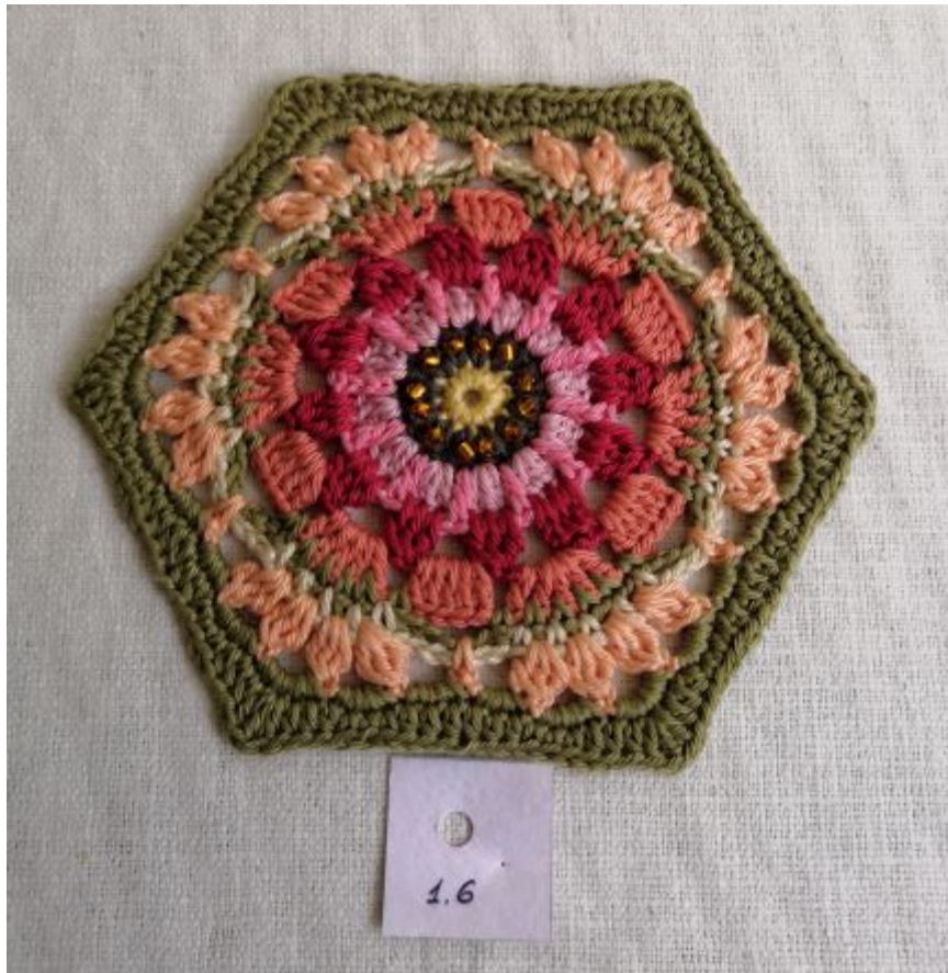
Picture 23. Motif 1.6 SIDE A